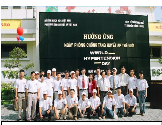
Fig 2. The VSH leaders team in Hue

In the big cities, such as in Central Vietnam, we held a meeting resulting in many scientific reports and published our recommendation of hypertension based upon those of ISH, JNC, BHS, CHEP (Fig. 3 and Fig. 4). The prevalence of arterial hypertension in Vietnam has now reached 23%, illustrating the significance of the problem. The government has therefore just decided to bring arterial hypertension under the management of the national program.