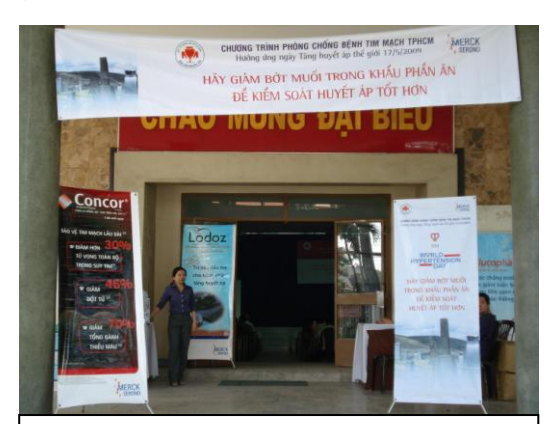
Fig. 5. World Salt Awareness Week 2009 in a sanitary centre in Ho Chi Minh City

In other cities such as in Ho Chi Minh City, meetings were held (Fig. 5) to increase awareness of the prevalence of hypertension. "Reduce salt intake now to lessen the high blood pressure in the future". (Fig. 6)