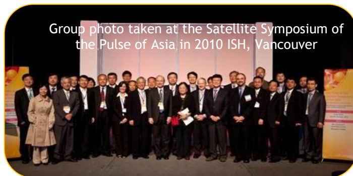
Group photo taken at the Satellite Symposium of the Pulse of Asia in 2010 ISH, Vancouver

In Oriental medicine, 'the Pulse' has been a principle for more than 4,500 years, before its clinical application in the 19th century in Europe. With a sustained enthusiasm on 'the Pulse' and the need for cross-talk between old and modern medicine, the Pulse of Asia ( www.pulseasia.org ) was developed in 2009 to lead research in the field of 'PULSIOLGY' to