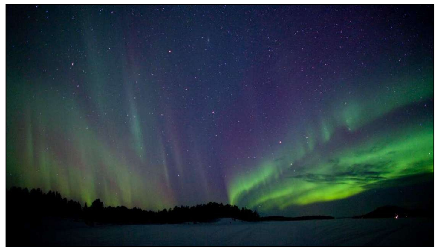
Nordic lights, Arjeplog, Sweden.