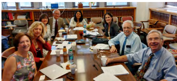
IASH Executive Committee members define the mission and objectives of the Society in Orlando, FL 2019.