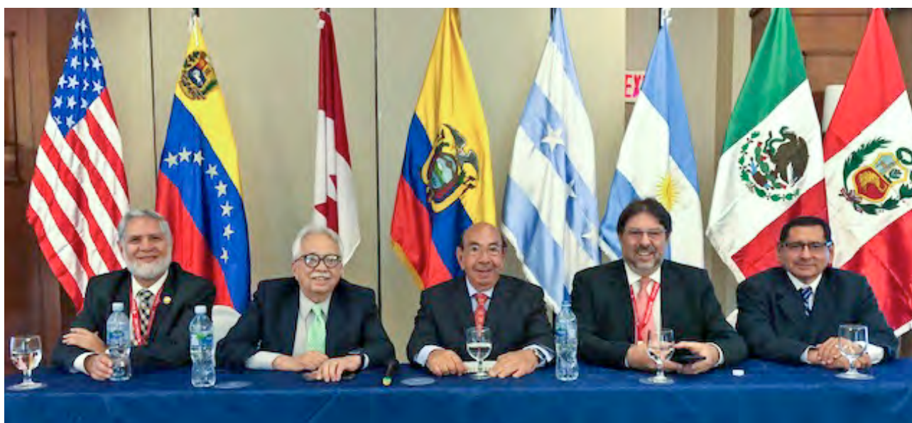
Opening Ceremony, 2018 IASH Scientific Sessions in Guayaquil, Ecuador.